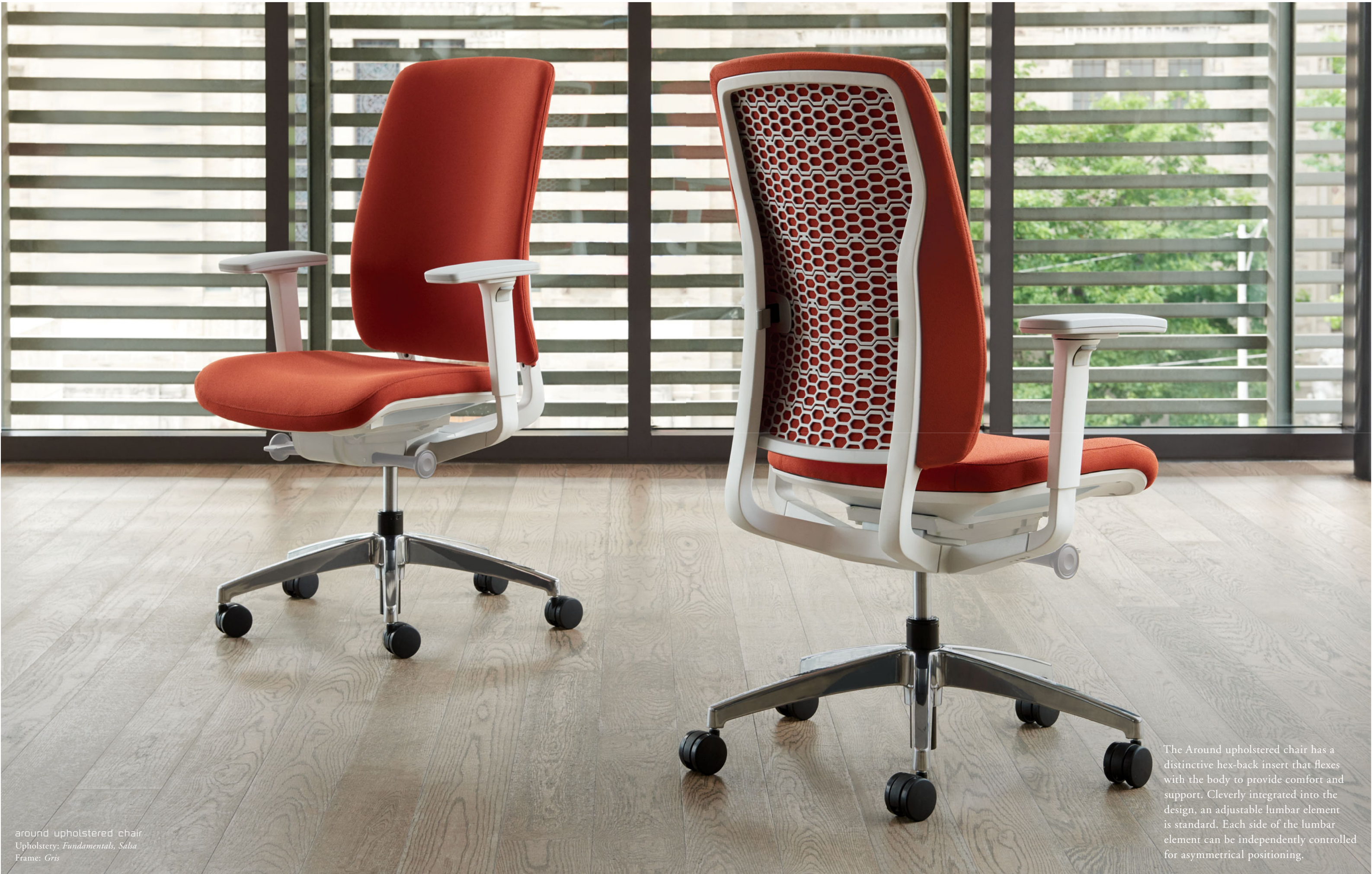
around upholstered chair Upholstery: Fundamentals, Salsa Frame: Gris

The Around upholstered chair has a distinctive hex-back insert that flexes with the body to provide comfort and support. Cleverly integrated into the design, an adjustable lumbar element is standard. Each side of the lumbar element can be independently controlled for asymmetrical positioning.