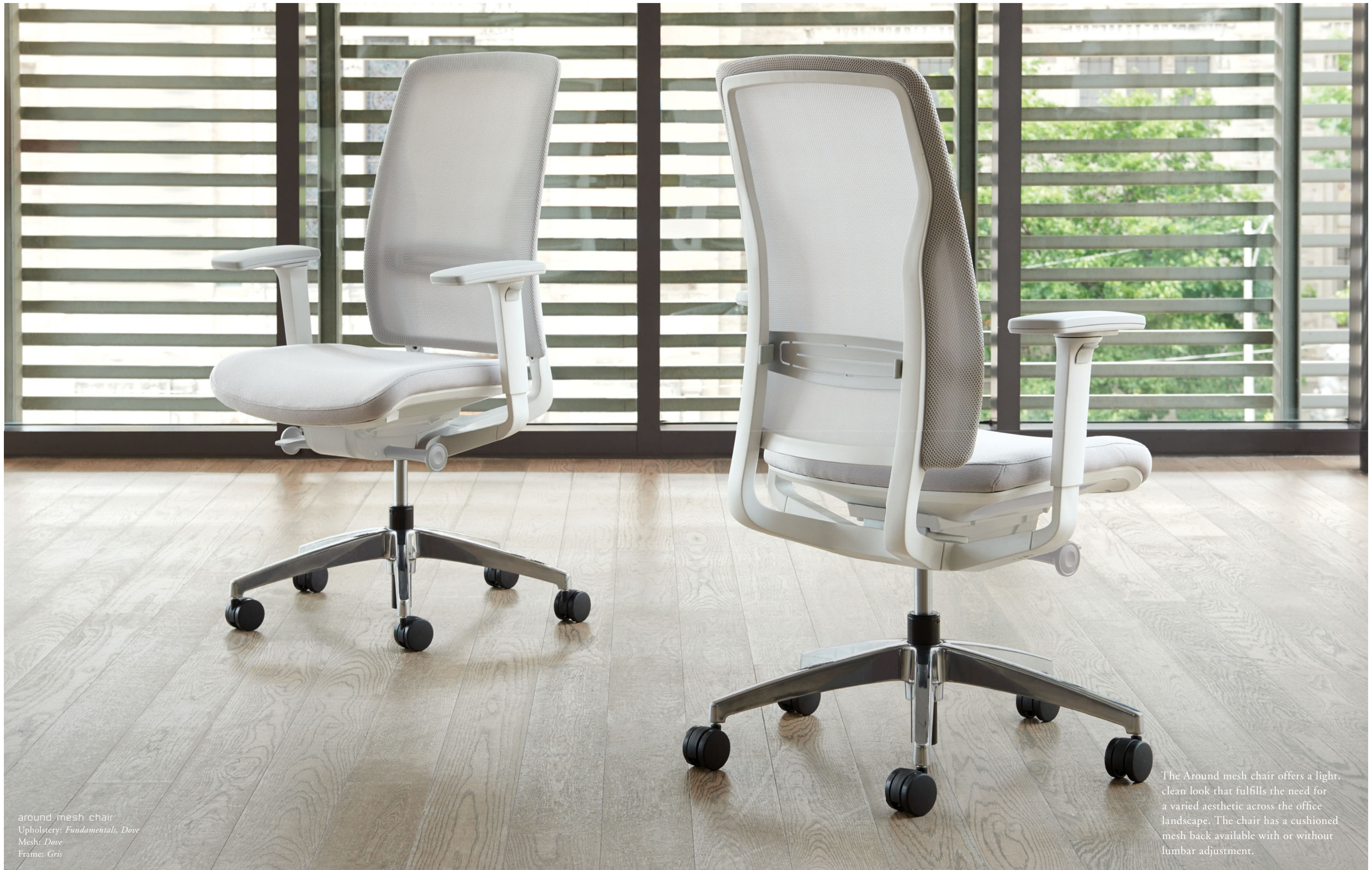
around mesh chair Upholstery: Fundamentals, Dove Mesh: Dove Frame: Gris

The Around mesh chair offers a light, clean look that fulfills the need for a varied aesthetic across the office landscape. The chair has a cushioned mesh back available with or without lumbar adjustment.