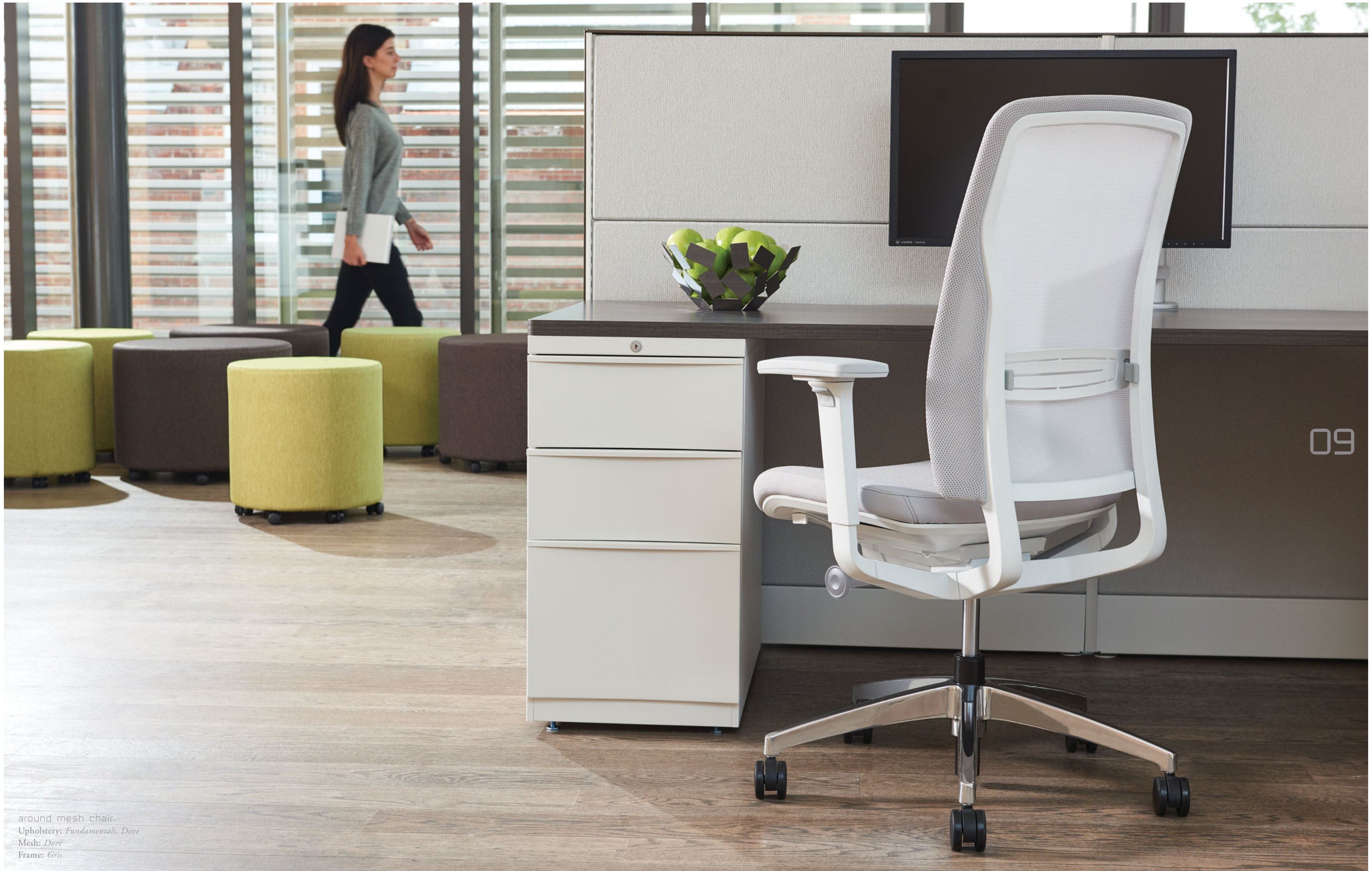
around mesh chair Upholstery: Fundamentals, Dove Mesh: Dove Frame: Gris