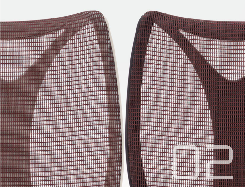
01 basalt mesh Very White Frame / Ebony Frame 02 phosphorous mesh Very White Frame / Ebony Frame