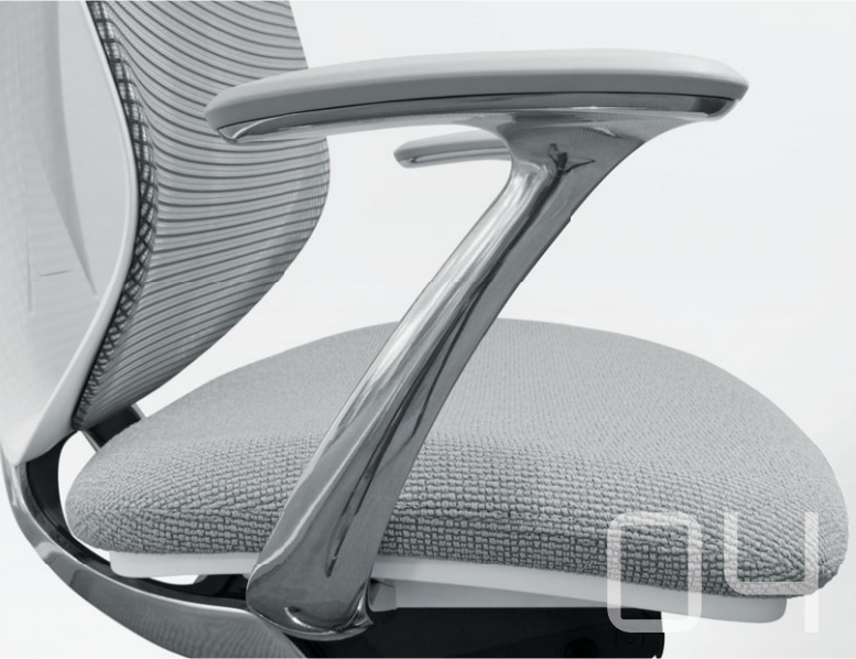
03 back ring accent The back ring features a Polished Aluminum detail accent for a refined finish and distinctive look. 04 fixed arm Optional fixed polished aluminum arm chair is ideal for meeting and management applications.