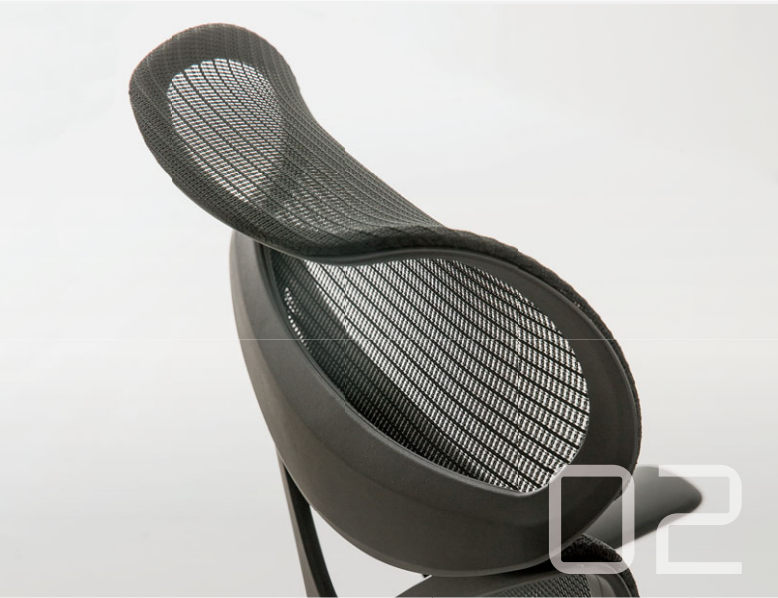
01 fit & flex back The back structure features an inner ring that conforms to user movements, while the outer frame twists for extra flexing. 02 headrest The streamlined design of the back's structural ring is mirrored in the optional headrest, featuring coordinating tensile mesh and outer frame.