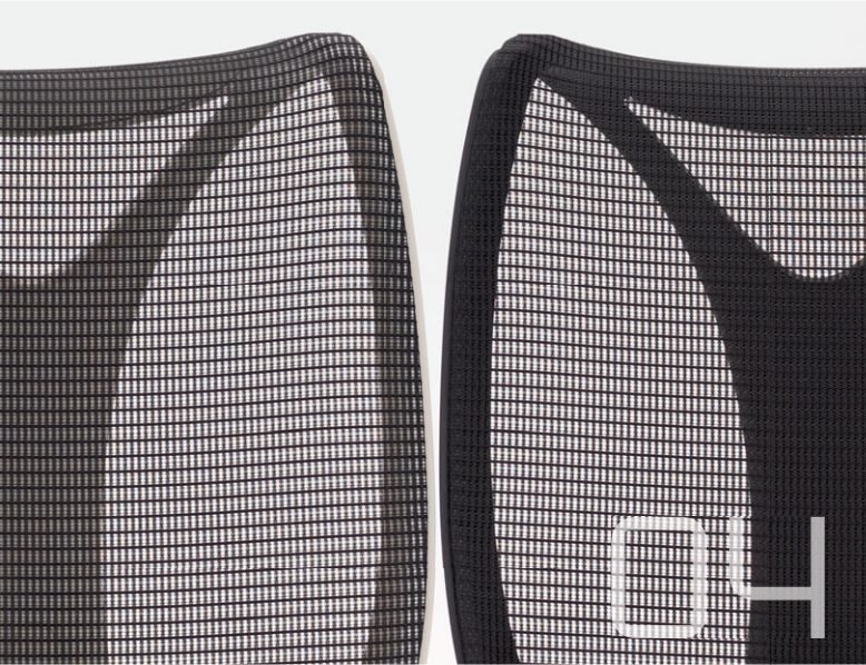
03 chainlink mesh Very White Frame / Ebony Frame 04 iron mesh Very White Frame / Ebony Frame